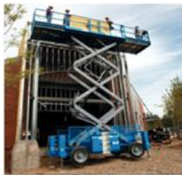
Hi-lift / Aerial